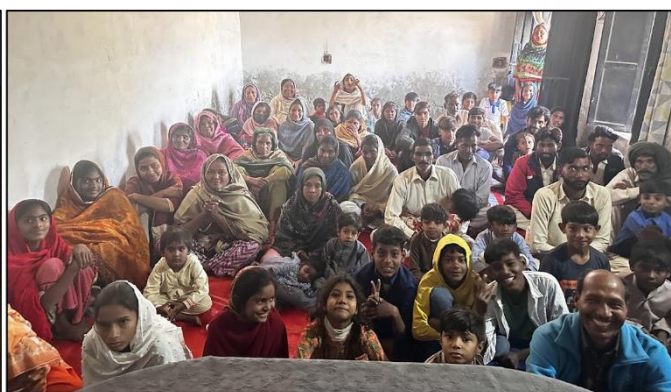
Inside the ecclesial hall at Qiampur, Toba Tek Singh

On this occasion, most of the new ecclesias and preaching locations I visited were in small rural towns. In Pakistan, where more than 90% of the population is Muslim, there is usually a 'Christian' section in each rural town, tucked away in a back corner. It's in these areas that the truth takes root - often beginning with one Christian family, and then spreading to neighbouring homes on either side, who are typically relatives or long-time friends.