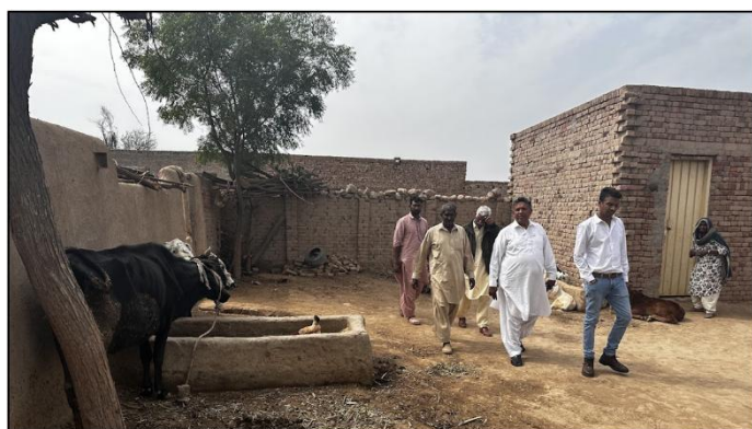
Outside the ecclesial hall at Qiampur, Toba Tek Singh

One of the key takeaways was seeing firsthand that most of our brothers and sisters across the ecclesias have a solid grasp of the one true gospel and are keen to deepen their understanding of Scripture. The number of baptised members continues to grow, and encouragingly, many are also maturing spiritually. This is largely due to the tireless efforts of local brethren, supported by regular weekly Bible classes via Zoom and WhatsApp, which around 20 ecclesias in Australia are providing.