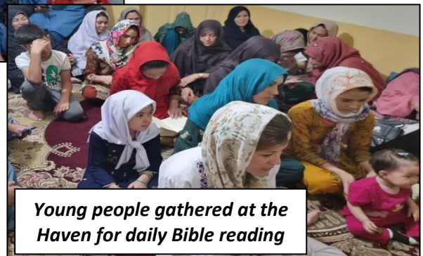
Young people gathered at the Haven for daily Bible reading

In neighbouring western Pakistan, we have recently leased a building we call “The Haven.” Supervised by widowed sisters, we have 30 people accommodated here, mostly