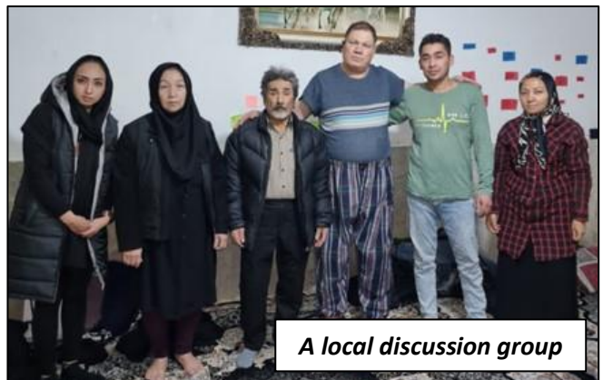
A local discussion group

Currently about 40 brothers and sisters are still in Afghanistan, mostly in hiding, plus 30 in western Pakistan (with many children and young people), and 16 among the families who fled to Iran.