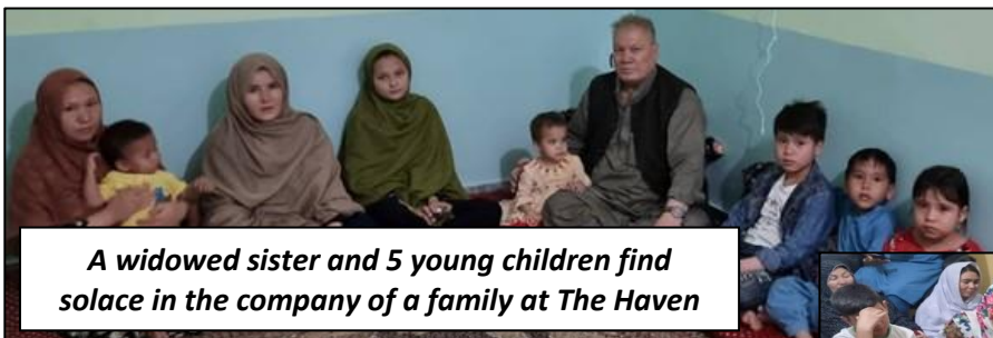
A widowed sister and 5 young children find solace in the company of a family at The Haven

young ladies given into our care to protect them from being used as reward brides to Taliban fighters.