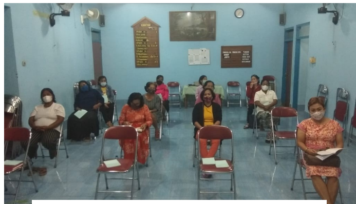
Sisters Class during the Covid restrictions

In Solo, meetings continued in small home groups during lockdown. Most regular activities have now resumed at their hall. Since Study Week 2020 and Study Day 2021 were cancelled, a Christmas event last December uplifted their spirits. In a Muslim country, Christmas is the only time Christians can be more open about their faith so we encourage them to take advantage of this. In February, the youth enjoyed and appreciated a full day excursion.