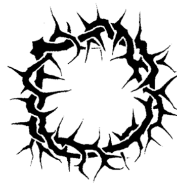
A Crown of Thorns

He was tempted to disobey God - to sin. But because he loved his Father so much and respected the words and commandments of God, he never gave in to temptation and died sinless, the only man ever to achieve this.